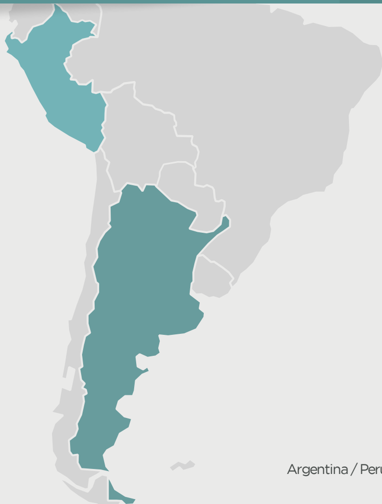
Argentina / Peru

Adapting extensive family farming systems to climate change to improve livelihoods